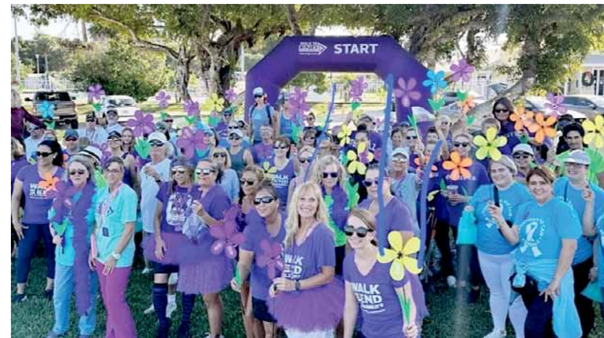
The start of the Walk to End Alzheimers. Great turnout! Thank you for your support! alz.org/walk