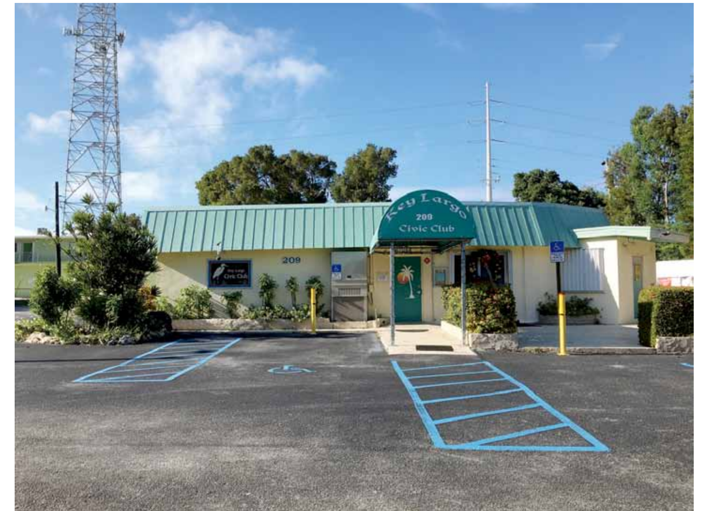
The present-day building is a busy meeting place for all kinds of community activities.

The club sponsored through the Chamber of Commerce, the Key Largo Canal Committee, which envisioned the Key Largo Waterway and saw it through to completion at no