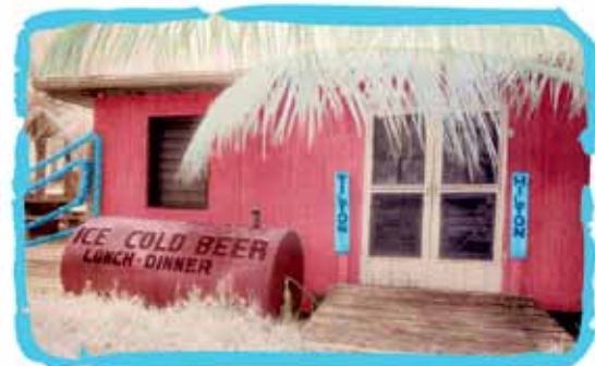
FRED'S TILTON HILTON - DOWNTOWN CARD SOUND ROAD

Discount code "CONCH" for 10% off fishing shirts