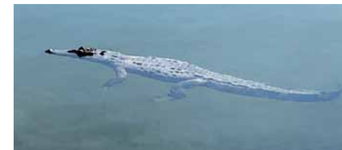
"Just one of our locals stopping by to say hello this morning. For anyone who thinks we post the Crocodile Warning signs to scare the tourists this is why the signs exist." Posted by the Lorelei in late April.