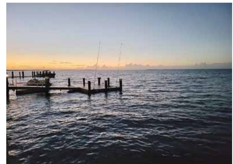
Another beautiful night in paradise at Jimmy Johnson's Big Chill.