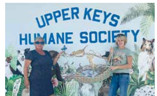
Upper Keys Humane Society was happy to receive hand woven cat hammocks from Fathom Doormats (30fathom.com/shop-2/).