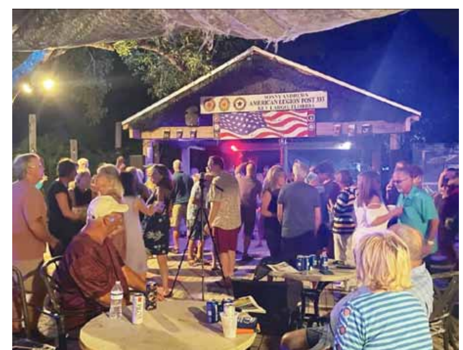
Don't miss Jam Night at the American Legion! Thursdays, 6-10pm.