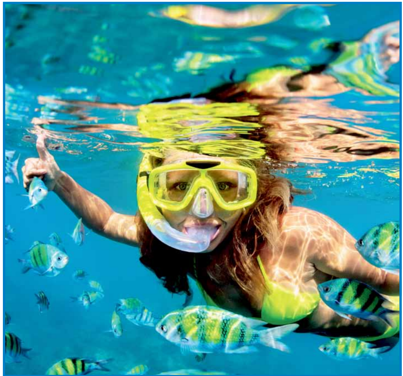
Pirates Cove Snorkel trips - see page 14.