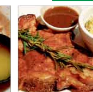
Prime Rib Dinner