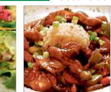
Kung Pao Bowl