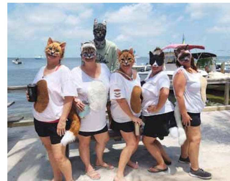
Upper Keys Humane Society Annual Critter Cruise Crawl.