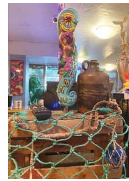
Florida Keys Brewery on tap at KL Moose