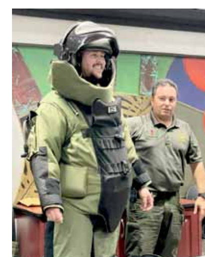
One of the students wearing the Bomb Squad Unit protection.