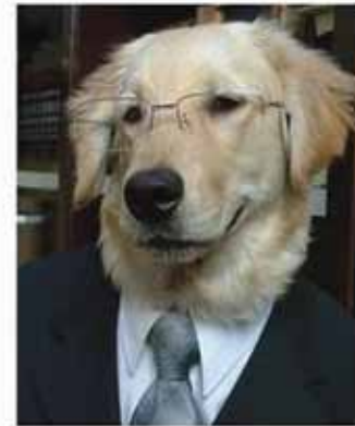
FIDO BONA ESQ Pawfirm Owner

Did your human break a treat in half and try to pass it off as a whole treat?