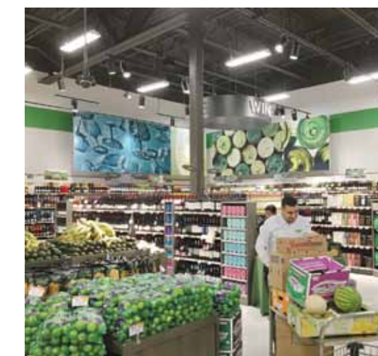
The big, new Publix store in the Tradewinds Plaza was a popular place when it opened in mid February. There are all kinds of exiting new areas to explore and things to see, and people came out in droves to visit!