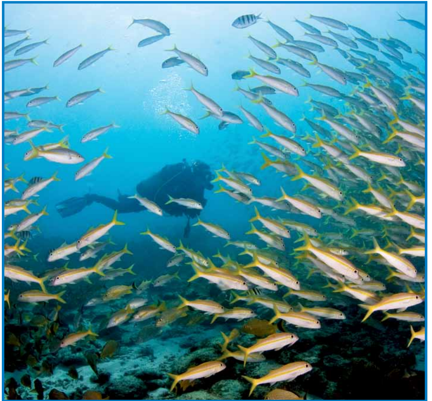
This could be you! Pirates Cove Watersports see page 14.

Coco-Nut Funnies Business in the Keys Classifieds Conch Characters