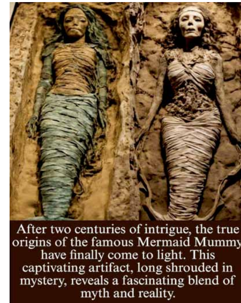
After two centuries of intrigue, the true origins of the famous Mermaid Mummy have finally come to light. This captivating artifact, long shrouded in mystery, reveals a fascinating blend of myth and reality.

Despite its popularity, skepticism surrounding the mummy's authenticity grew. Many believed it to be a hoax or a cleverly crafted piece of art rather than a genuine specimen of