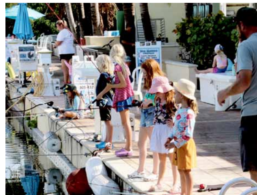
Sixty-five anglers registered for the shoreline division, most fishing from the docks at the Lorelei, the home of the 27th Annual Keys Kids Fishing Derby