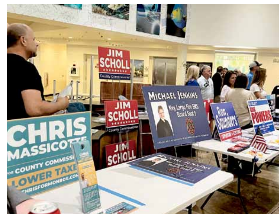
The October Candidates Forum was a lively event with a US Representative to Monroe County, Islamorada candidates and an energized voting public. Kudos to the Federation, BPW, Tavernier Community Assn., and the Upper Keys League of Women Voters.