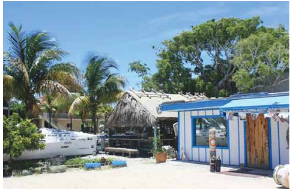
Shipwrecks Bar & Grill at 45 Garden Cove Dr (MM106) is a local's favorite!