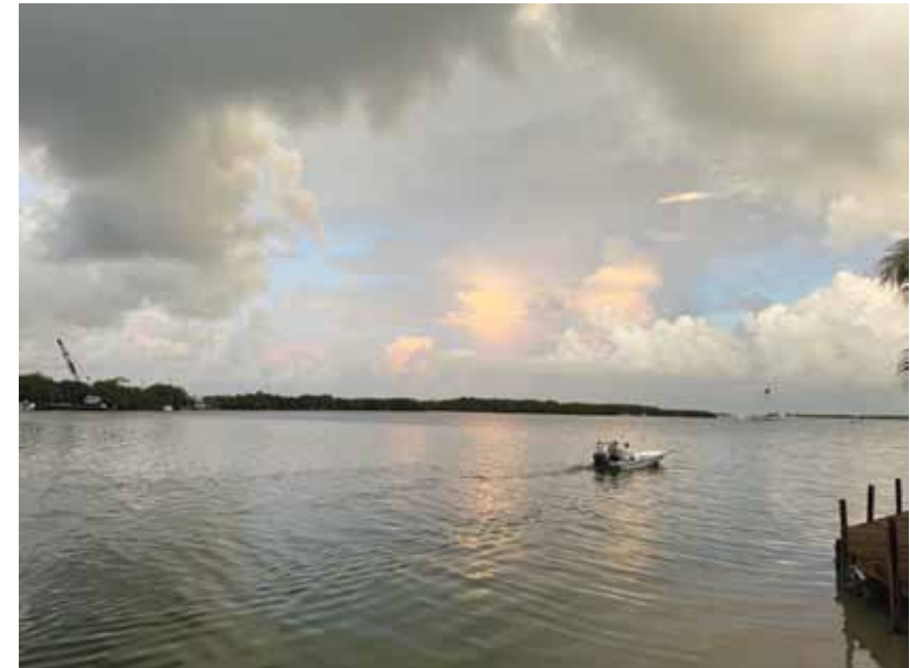
Good morning from the Lorelei!!!! Come join us for breakfast!!