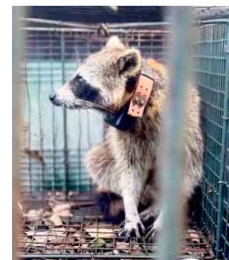
This collared raccoon was known as "Fighter" - he was covered with scars; a truly wild raccoon who never went into people-occupied areas, such as neighborhoods or the waste transfer station. There aren't many raccoons like him anywhere in the world.

"Monroe County health professionals warn county residents to avoid all wild or unvaccinated animals and this, unfortunately includes squirrels. While many residents possess great affection toward squirrels and their antics, the very treat you present to a squirrel may act as an invitation to less desirable animals."