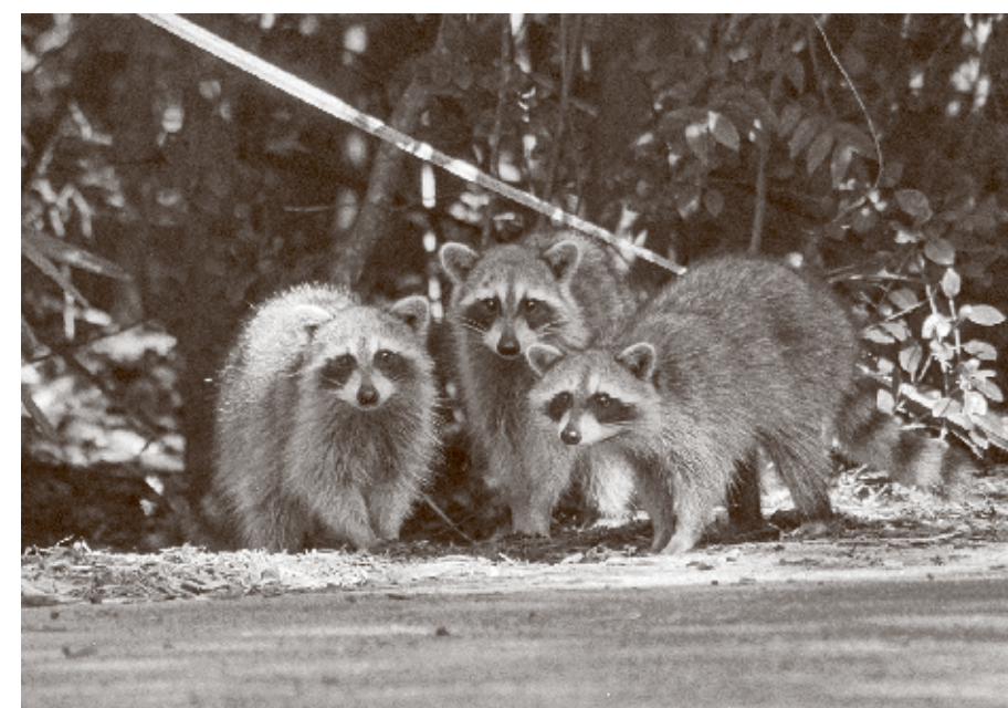
A group of raccoons on the edge of the woods. This black and white photo is very much how a raccoon would perceive the world, since their vision is rendered in greyscale.

began disappearing. Camera traps placed inside woodrat nests provided evidence when a python preying on a woodrat was caught on video.