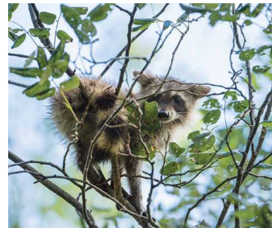
This baby raccoon was seen high in a tree, its fur was still wet from days of tropical rains.