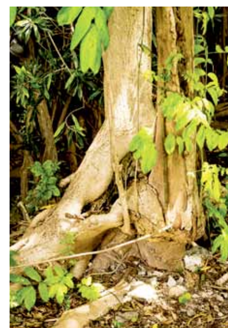
The base of a hollowed out tree provides a suitable place for a raccoon den.

Raccoons have few natural enemies other than man, and automobiles kill more raccoon than anything. Luckily for the raccoon, urban food resources do allow these mesopredators - medium sized carnivorous animals such as raccoon and possum - to occur at much higher densities than the