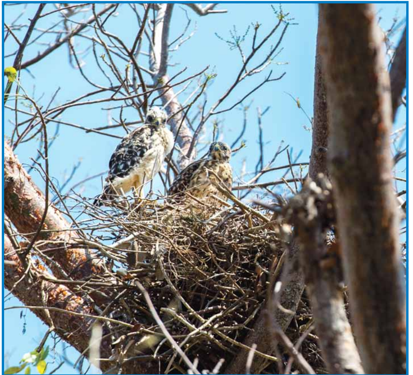
A baby Red Shouldered Hawk sits beside its parent after being rescued from a fall to the ground.. see the article on pages 4-5 for more bird rescues and information.

Coco-Nut Funnies Business in the Keys Adopt a Key Largo Shelter Pet Conch Characters