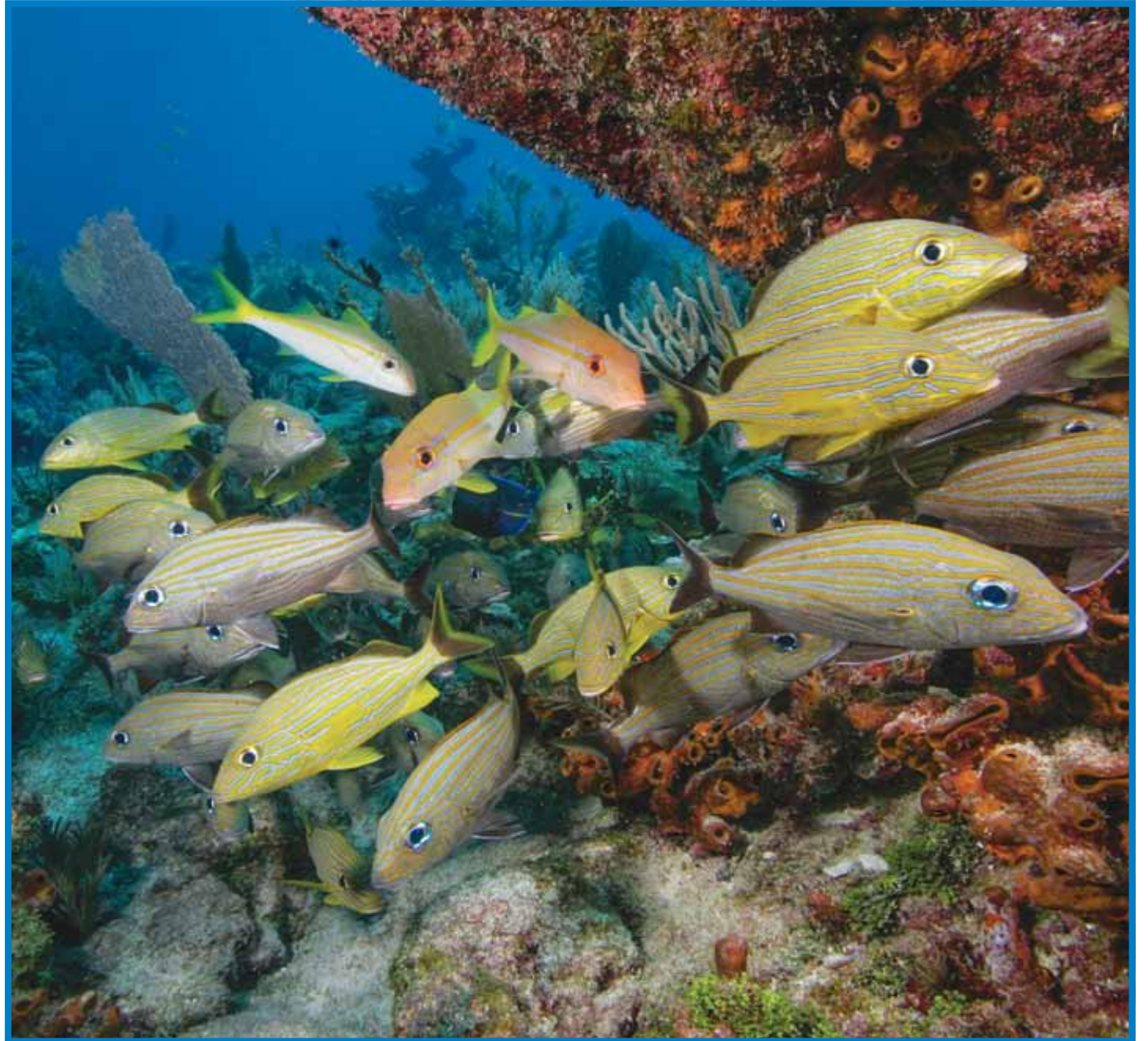
A mixed school of fish underneath a sponge-covered coral formation in the Florida Keys National Marine Sanctuary.

Coco-Nut Funnies Business in the Keys Adopt a Key Largo Shelter Pet Conch Characters