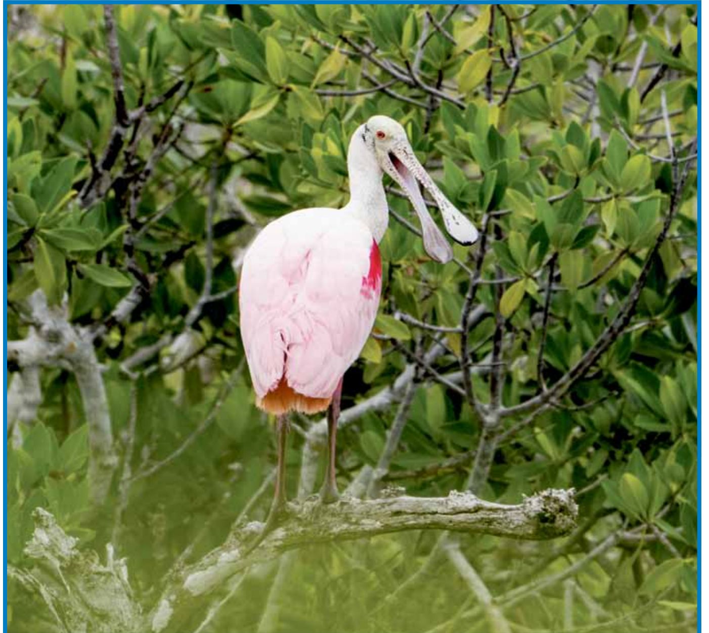
Roseate spoonbill chicks are almost pure white. Like the Pink Flamingo, the Roseate Spoonbill's pink color is caused by the nutritious food they eat, including small crustaceans such as shrimp, and the occasional fish, insects and plant parts. Photo by Carol Ellis; see her article on Wading Birds this month, pages 4-5.

Adopt a Key Largo Shelter Pet Conch Characters