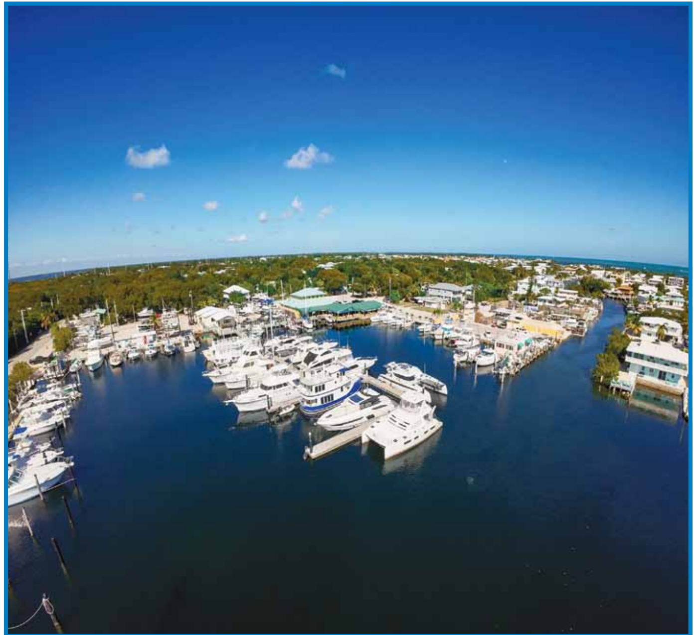
The Pilot House Restaurant and Marina at 13 Seagate Blvd. in Key Largo is a beautiful and enduring Key Largo landmark and a favorite of locals and visitors alike. Stop by for a cold one and some fabulous seafood!

Serving our Florida Keys families for all your immediate and pre-need cremation and funeral needs.