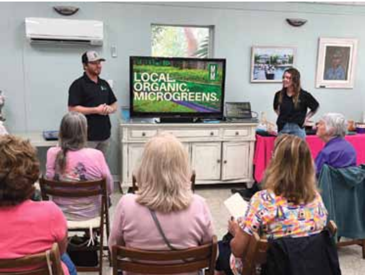
Education, social time and a great selection of speakers makes for a full afternoon meeting. Matecumbe Microgreens teaches how delicious and nutritious your plants can be.