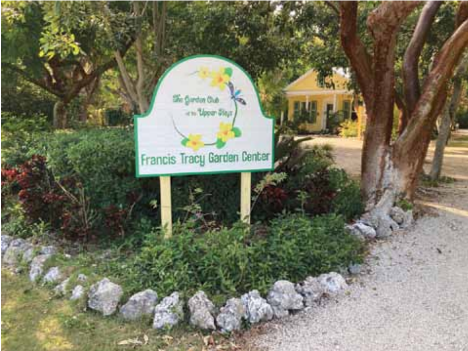
The gardens themselves are a work of art, with members maintaining different sections, showcasing a variety of native and exotic plants that thrive in our unique climate.

Our island habitat offers some challenges and some blessings when it comes to gardening. There is no better way to learn about what to grow in the Keys than to talk to the members of the Garden Club of the Upper Keys at one of their gatherings.