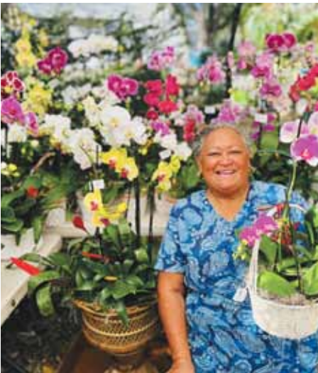
The Holiday Market (coming on December 6th) brings vendors from South Florida to the Keys.