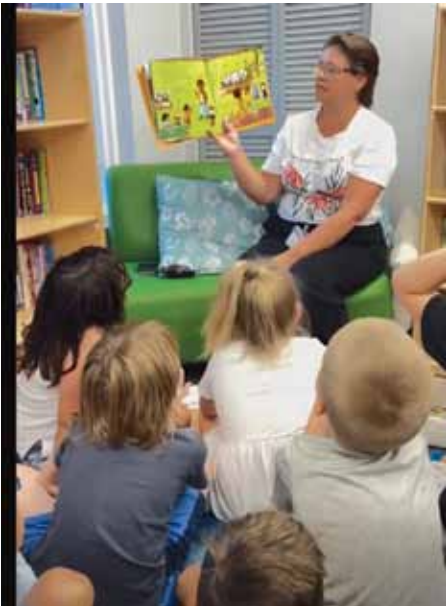
Encouraging love of gardens at an early age, the Garden Club supported Key Largo School and Ocean Studies Charter School during the Great South East Pollinator Count.