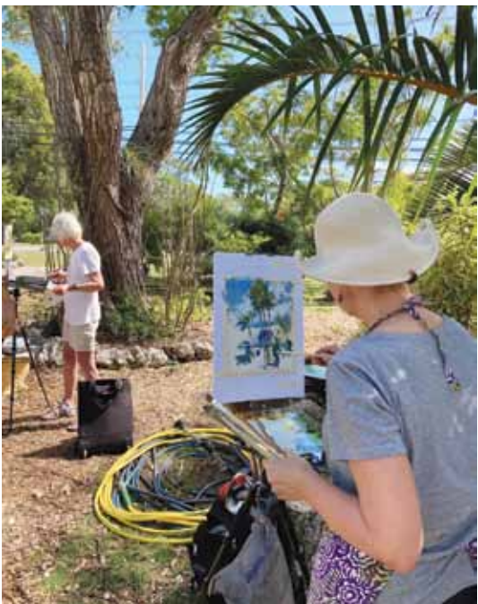
Sharing the garden grounds with artists just seems like a natural partnership.