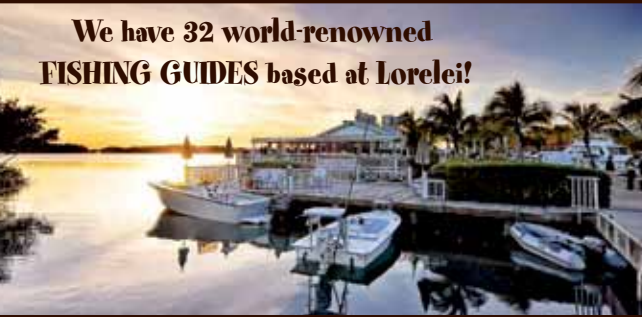
We have 32 world-renowned FISHING GUIDES based at Lorelei!