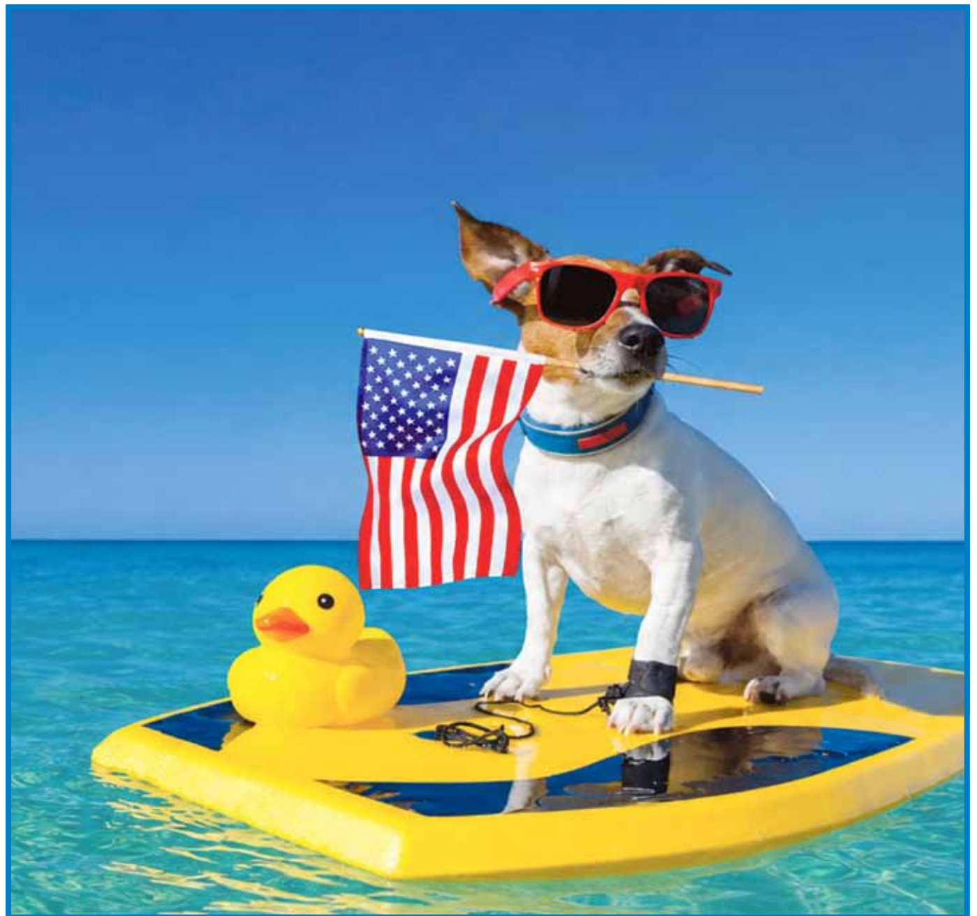
July starts with a bang and delivers hot, summer beach weather in the Keys.

Coco-Nut Funnies Business in the Keys Adopt a Key Largo Shelter Pet Conch Characters