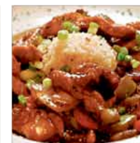
Kung Pao Bowl