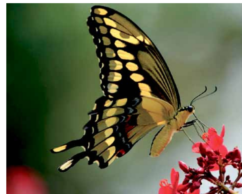
Schaus Butterflies have few habitats. They can be found at the Crocodile Lakes location.

Email crocodilelake@fws.gov for more information.