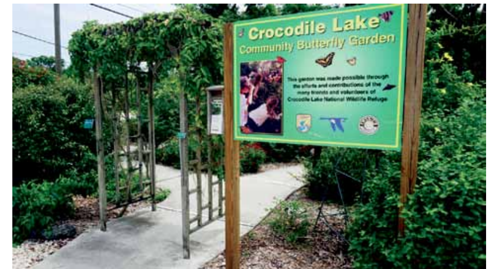
The butterfly garden and visitor station provide a perfect window into this hidden world, offering a peaceful and beautiful experience that's a little off the beaten path

The refuge and its surrounding area host occasional educational events, especially during National Wildlife Refuge Week, the second week of October. These events, which might include bird walks or lectures, are a great way to learn more about the wildlife and conservation